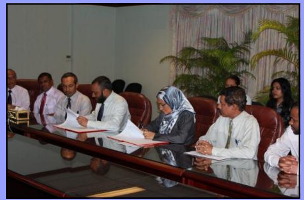
Minister of Islamic Affairs and CEO of CMDA signing the MoU at a ceremony held in Islamic Center (30 October 2012)

Other important arrangements under the MoU include cooperation between the Capital Market Shari'ah Advisory Committee (CMSAC) and the Fiqh Academy, CMDA representation on the Zakath Fund Committee, and joint Islamic finance awareness programs.