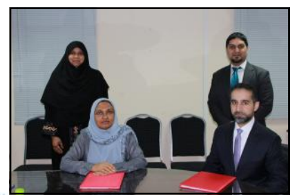
Visit of Simmons & Simmons consultants to CMDA (8-10 December 2012)

Representatives from Simmons & Simmons made an introductory visit to CMDA from 8th - 10th December 2012. The consultants attended meetings with the stakeholders to identify stakeholder interest and the practicality of Sukuk market development in the Maldives.