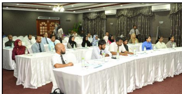
Training Course on Fundamentals of Islamic Capital Market Nasandhura Palace Hotel, Male' (7 - 11 October 2012)

The Training Course on Fundamentals of Islamic Capital Markets was conducted at Nasandhura Palace Hotel from 7th–11th October in collaboration with Islamic Research & Training Institute (IRTI) of IDB. The course was inaugurated by the Minister of Islamic Affairs, Al-Sheikh Mohamed Shaheem Ali Saeed.