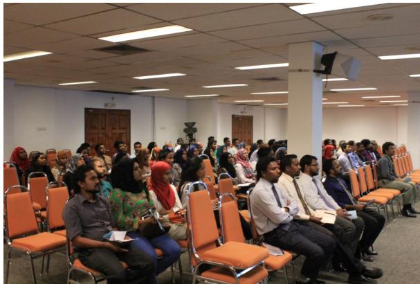
ڈیپارٹمنٹ آف ایجوکیشن ڈائریکٹوریٹ برائے تعلیم و تربیت کی 2015ء کی کانفرنس