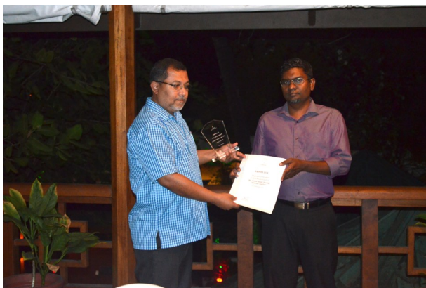
سی۔ اے۔ ڈی ڈائریکٹوریٹ برائے تعلیم و تربیت (ڈیپارٹمنٹ آف ایجوکیشن ڈائریکٹوریٹ برائے تعلیم و تربیت) کی 2015ء کی کانفرنس