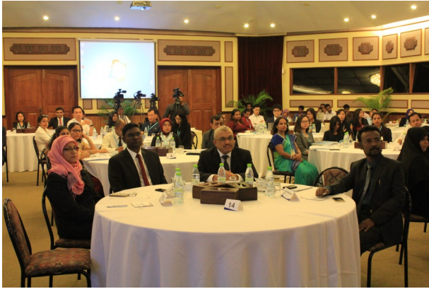
مجلس سروس سٹریٹجی کے لیے ڈائریکٹوریٹ برائے تعلیم و تربیت کی سربراہی میں 2015ء کی کانفرنس