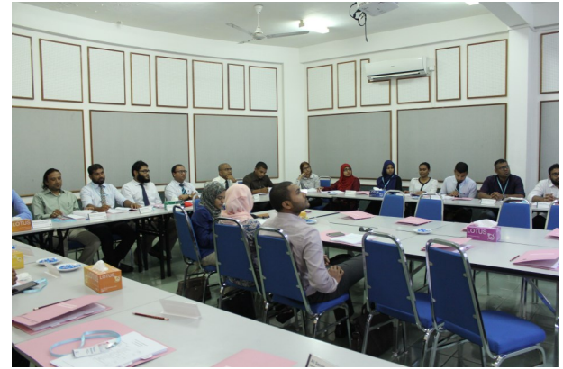
ڈیپارٹمنٹ آف ایجوکیشن ڈائریکٹوریٹ برائے تعلیم و تربیت کی 2015ء کی کانفرنس