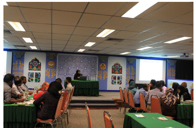
ڈیپارٹمنٹ آف ایجوکیشن ڈائریکٹوریٹ برائے تعلیم و تربیت کی 2015ء کی کانفرنس