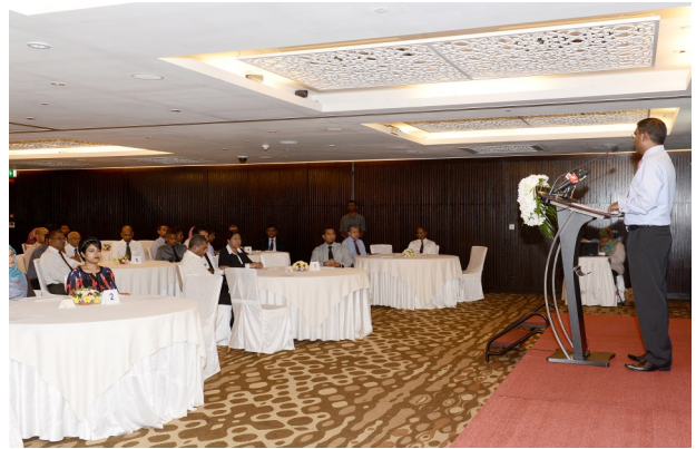
ڈیپارٹمنٹ آف ایجوکیشن ڈائریکٹوریٹ برائے تعلیم و تربیت کی 2015-2019 کی کانفرنس